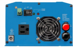
Phoenix Inverter 12/800 with Nema 5-15R socket