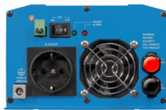
Phoenix Inverter 12/800 with Schuko socket