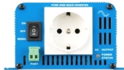
Phoenix Inverter 12/180 with Schuko socket