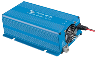
Phoenix Inverter 12/180