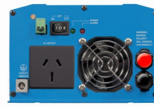
Phoenix Inverter 12/800 with AN/NZS 3112 socket