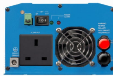
Phoenix Inverter 12/800 with BS 1363 socket