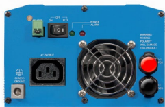
Phoenix Inverter 12/800 with IEC-320 socket