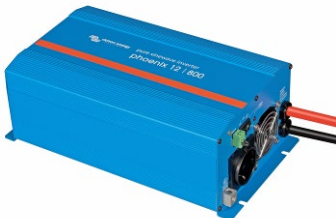
Phoenix Inverter 12/800 with Schuko socket

For our lower power models we recommend the use of our Filax Automatic Transfer Switch. The Filax features a very short switchover time (less than 20 milliseconds) so that computers and other electronic equipment will continue to operate without disruption.